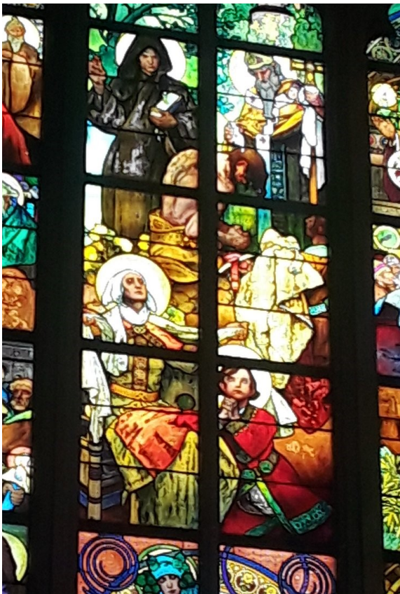
Detail of the window designed in Art Nouveau style by Alphonse Mucha in Prague’s St. Vitus Cathedral . It shows the baptism of Wenceslas’s grandfather by Saints Cyril and Methodius, and his grandmother Ludmila praying with him.

But who was this “good King Wenceslas,” then? Wenceslas (in Czech, Václav) was duke of the Bohemians in the early tenth century. The ruling family had accepted Christianity only two generations earlier, and there was still resistance. Wenceslas’s grandmother, Ludmila, ensured the young heir was raised in the faith, but she was martyred by supporters of the young boy’s mother (who was from a pagan Slavic tribe) when Wenceslas was 13. When he came of age five years later, he sent his mother into retirement and directed the realm until his death. His brother, Boleslav, who disagreed with him over policy towards the neighboring Germans, arranged for Wenceslas’s murder, probably in 935, and seized power in Bohemia in his own name.