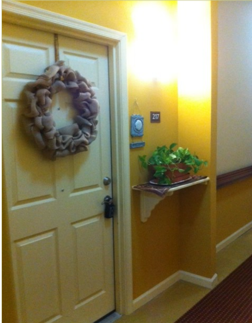
Mareea's New Place